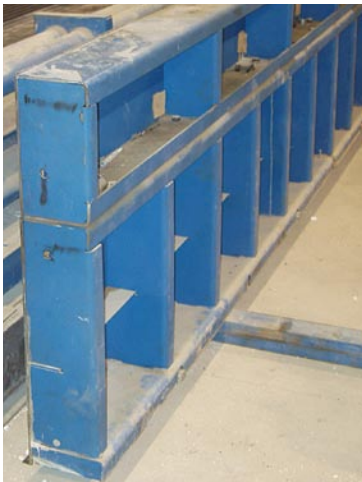
24" side form with 12" riser anchored with magnets.