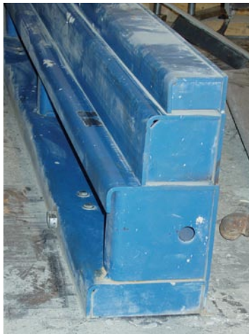
Side rails custom made with risers that stack on top.