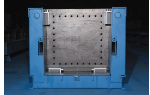
Header held in place with On/Off magnets.